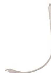
WPC-20 Water Probe Cable 20cm