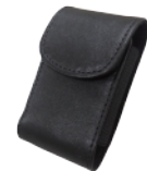
Protective Leather Case