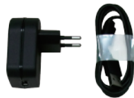
Mobile Lite + Travelers Charger Set